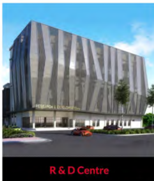
R & D Centre